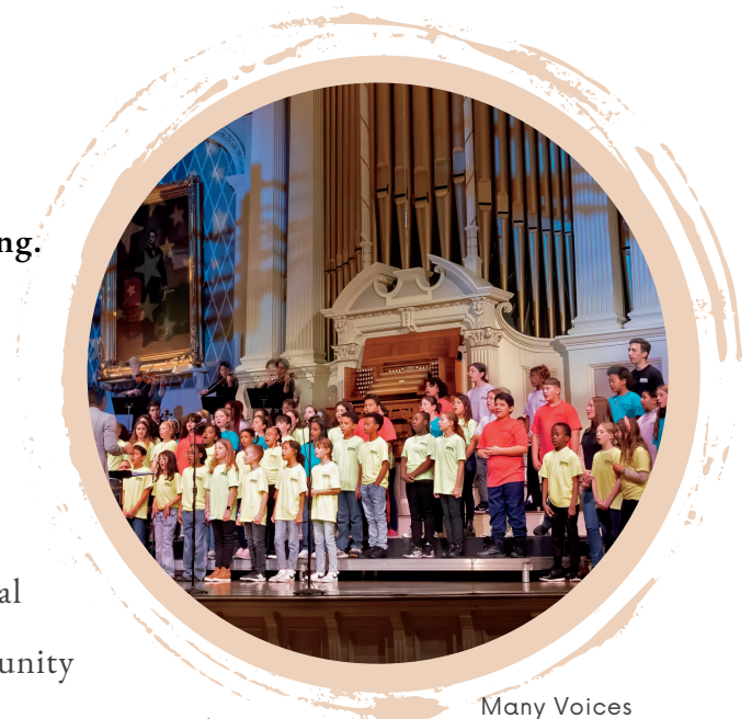
Many Voices October 2023 Concert

The vision of our founders was to inspire and enrich the community. Today in this Hall, Worcester continues to celebrate, share knowledge, and experience live musical performance because you believe in our mission. Your financial support ensures that Mechanics Hall continues to host community and culture. As 2023 draws to a close, the Heart of the Community year-end campaign is upon us. I am appealing to you to respond with a gift in support of our irreplaceable treasure.