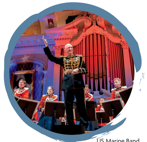
US Marine Band Brown Bag Concert Series 10/18/22

More than 100 fifth and sixth graders have participated in some way during the last 12 months. These enthusiastic learners sing in full voice with an instrument combo, and in three-part harmony! They made friends and created something beautiful together on their very own world-class stage.